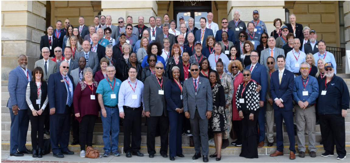
Attendees of the 41 st TOI Lobby Day